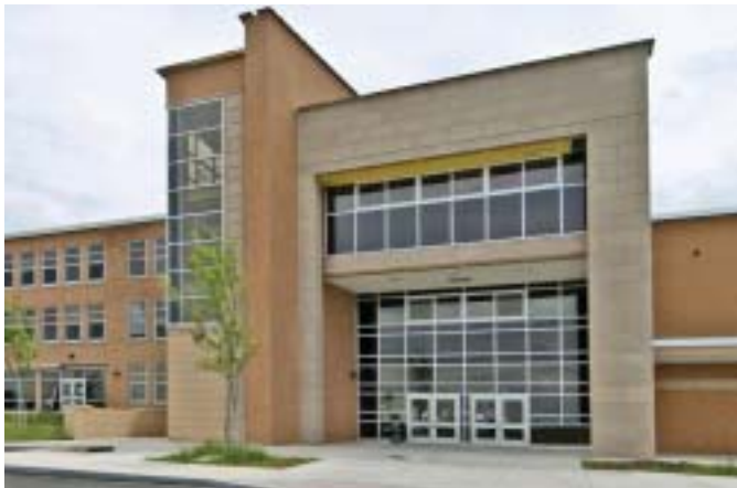
New Sutherland High School entrance.

The 2006-2007 school year opened with the addition of the newly constructed Calkins Road Middle School. The school welcomed 6th, 7th and 8th graders on opening day, September 5, 2006. The ribbon was officially cut on the new Calkins Road Middle School on September 9, 2006.