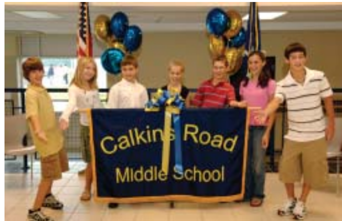
Calkins Road Middle School ribbon cutting.

Students returned to Sutherland High School in the fall to find many improvements and the completion of a number of new projects. Twenty-two classrooms were renovated with new ceilings, lighting, floors and paint, and the new foreign